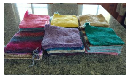
■ Heather Wingate