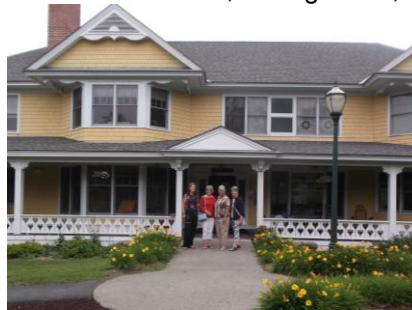
▪ Bette Frazier

bagging them by themes, sewing 4 patches, assembling quilt tops, attaching borders, sandwiching, sewing up the turning hole, machine quilting making the label, and attaching the labels took time, patience, commitment, and perseverance! The best news is that 25 children will be "Sew Blessed" by your labor of love! God bless you all!