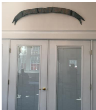
SUCCESS AT LAST!