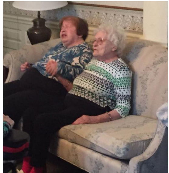
Two friends at the Genesis nursing home enjoy the church service provided by FCC.