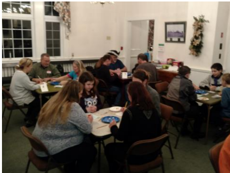
The game of Bunco offered fast-paced fun!