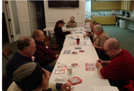
Players concentrate on their Bingo cards.