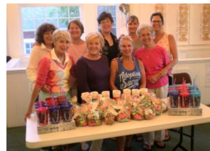
Volunteers provide goody bags for Wolfeboro Inn employees

Mark your calendars! On Wednesday, October 5 th , from 9 AM to 3 PM, Missions Motion will be getting together a team to go do some jobs at New Life Home, and you can help! We are hoping to bring with us much-needed paper goods for this important ministry. You'll soon see a box in the foyer in which to place paper towels, napkins, and bath tissue. Your contributions will be much appreciated and will go toward a very deserving ministry that assists abused women and their children. Thank you so much for your donations!