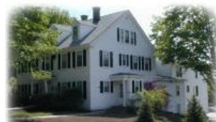
New Life Home in Manchester