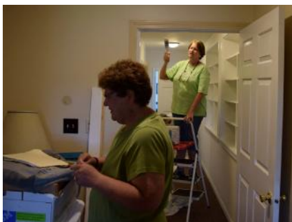
Prepping the church library